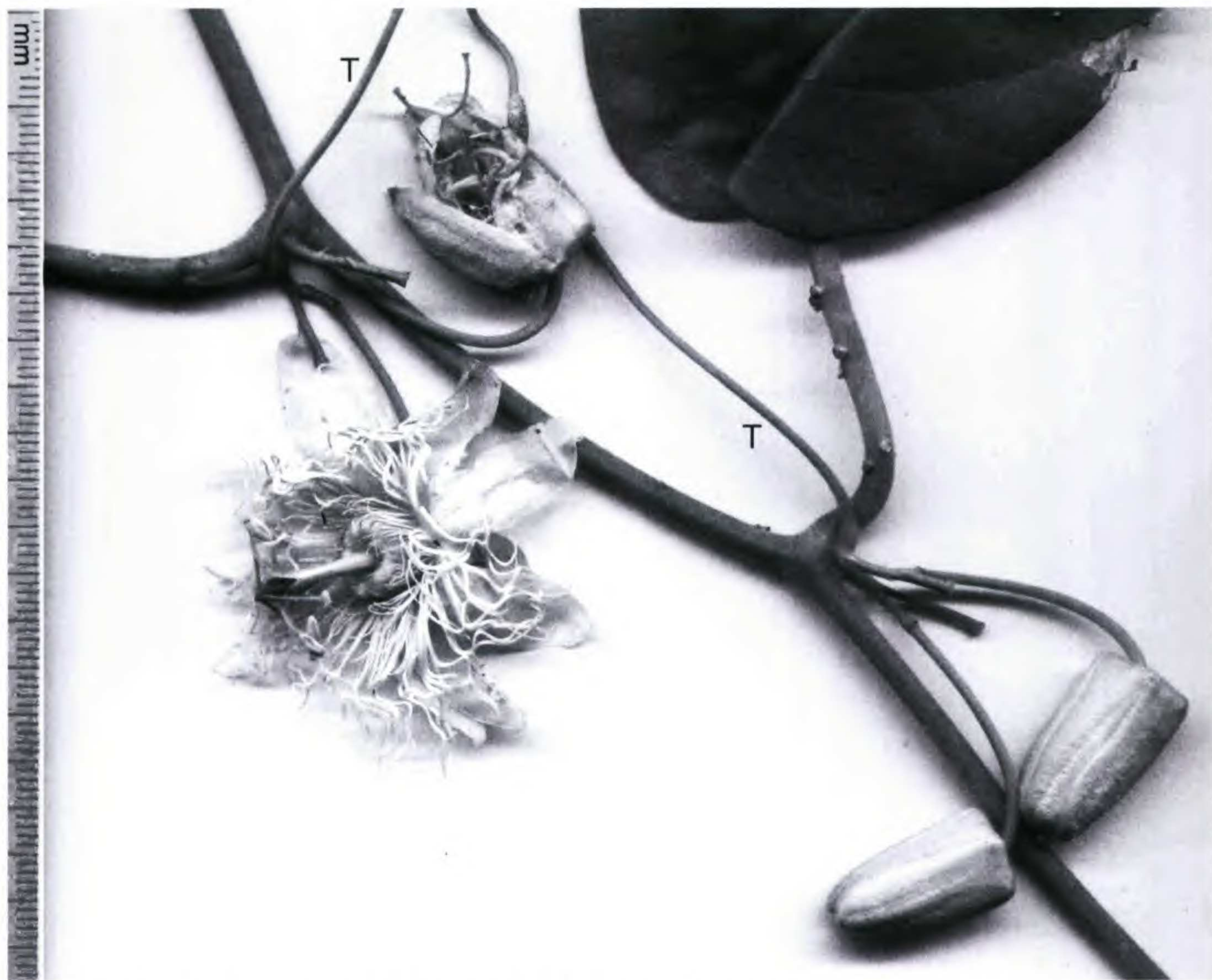
Figure 2. Passiflora lancetillensis J. MacDougal & J. Meerman. Two nodes along a stem, with associated leaves and peduncles. Interpretation of the structure of the inflorescence is aided by the letter "T" marking the tendrils. The articulations of the pedicels marking the floral stipes can be seen as darker lines on the pedicels. Scan by Jan C. Meerman of living plants of the type material (Meerman s.n.).

cluding stigmas, green and unmarked, usually lightly pubescent proximally. Fruit 6.5–8 cm long including 2.5–3.0 cm long stipe, 4.0–4.8 cm diam., widely ellipsoid or subglobose, slightly conical at attachment of stipe, blunt at apex, light green or yellowish green at maturity, inflated, indehiscent (but easily splitting into three parts with slight pressure), without strong odor, short-pubescent inside on placental walls with erect thick trichomes, exocarp very thin, leathery, drying parchment-like, ca. 1 mm thick; arils translucent whitish, insipid; seeds ca. 20 to 36 per fruit, 9.5\text{--}11.5 \times 7.0\text{--}8.0 \times 2 mm, dark brown, punctate-reticulate in center, the pits sometimes weakly organized into a few wavy rows, with 4 conspicuous marginal wings, (1.5–)2–2.5(–3.0) mm wide, striate, deeply erose to lacinate (to deeply lacinate at micropylar end), the chalazal beak antiraphal; germination epigeal.